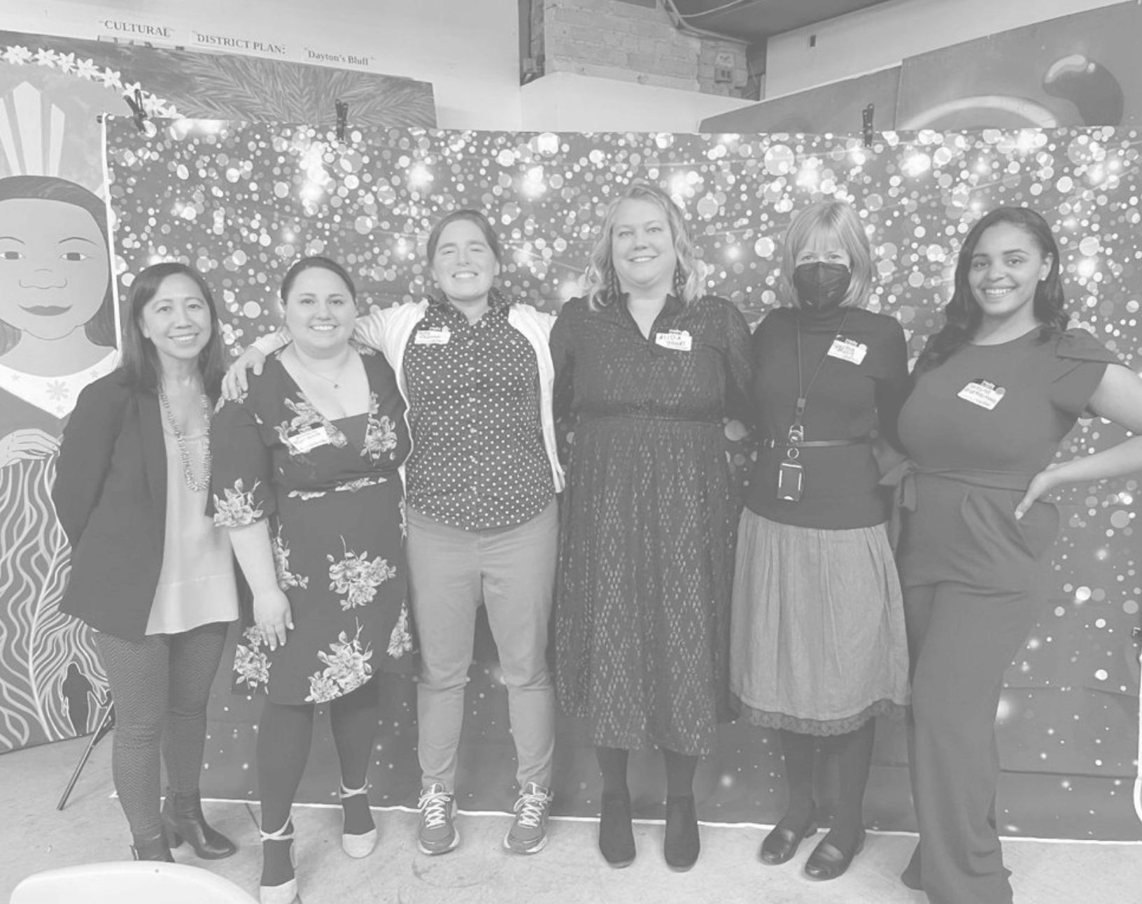
Image Description: Six MNEA board members in front of a sparkly backdrop smiling at the camera